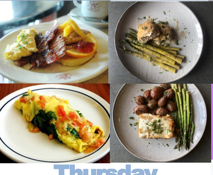
Chicken Cordon Bleu

Scrambled Eggs Bacon Sausage Home Fries French Toast