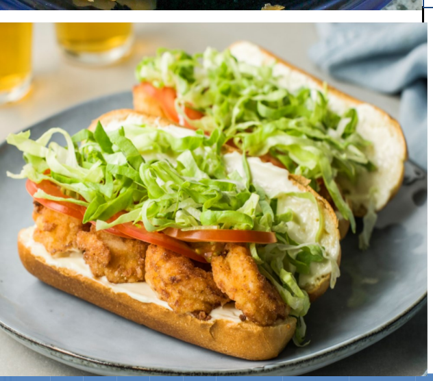
Friday Shrimp Po Boys Avocado & Egg Salad Sandwich Corn Roasted Baby Carrots