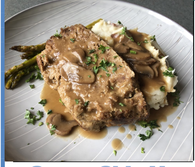
Tuesday Meatloaf Spinach Artichoke White Bean Sandwich Mashed Sweet Potatoes Asparagus

Monday Dinner Lemon Garlic Chicken Mushroom Spinach Quiche Brown Rice Green Beans