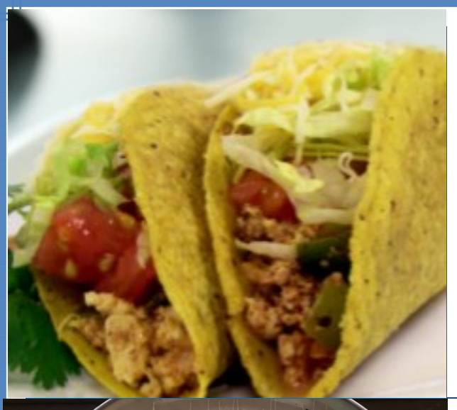
Monday Ground Turkey Tacos Impossible Burger Tacos Refried Beans Corn