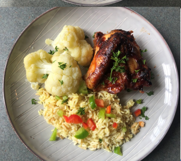
Friday Mango Habanero Chicken Stuffed Spanish Eggplant Jasmine Rice Broccoli