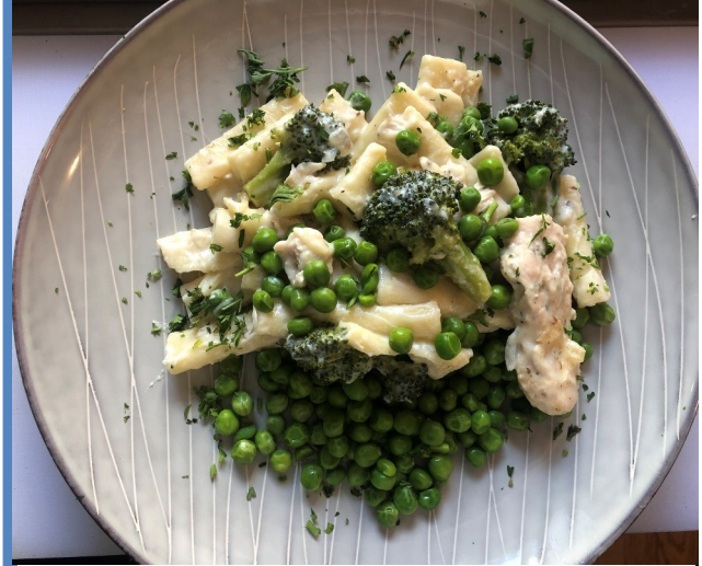
Tuesday Chicken and Broccoli Ziti Buffalo Cauliflower Casserole Garlic Bread Glazed Carrots