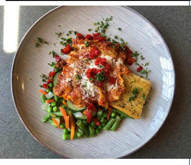
Thursday Ground Turkey Lasagna Vegetable Lasagna Garlic Bread Broccolini