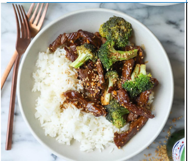
Tuesday Beef and Broccoli Orange Ginger Chickpea Stir Fry Brown Rice Glazed Carrots