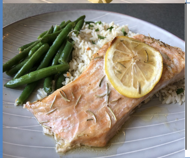
Friday Lunch Baked Salmon Lentil Cakes Roasted Gold Potatoes Summer Squash Medley