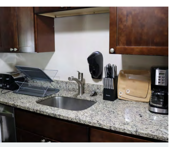
Many thanks to our longtime partner Macy's. They generously donated more than $7,500 in gift cards specifically to outfit this program and ensure that each person has what they need.