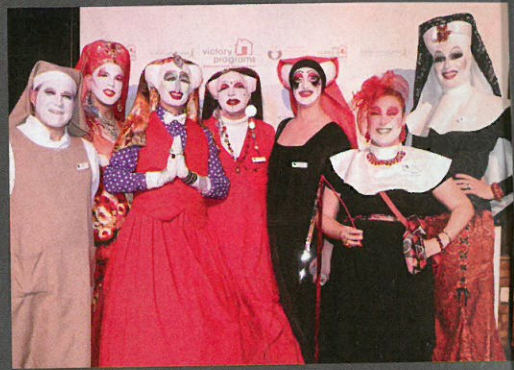
Boston Sisters of Perpetual Indulgence